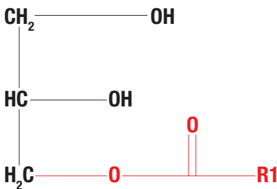
Figure 1. Monoglyceride Chemical Representation in MaxSimil Fish Oils (R1 = fatty acid)

Unique structure: One fatty acid attached to a glycerol backbone provides two polar ends that attract water and a non-polar tail end (R1) that attracts fat, thus enabling self-emulsification of the MonoAbsorp Omega 1300 formulas.